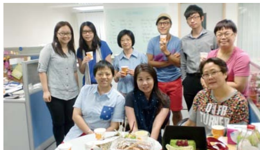
我們很高興與義工們一起分享遷進新辦公室的喜悅。 We were so glad to share our happiness our moving into new office with our volunteers.

We look forward to seeing you in our next gathering!