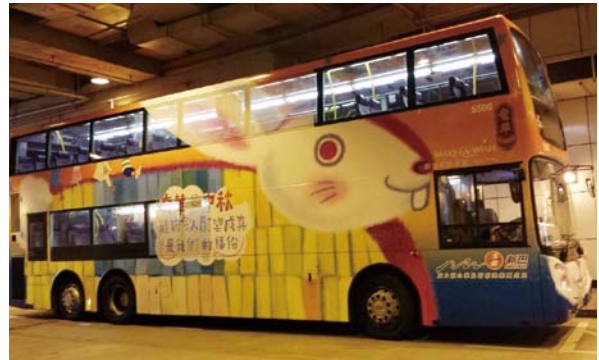
第一架「中秋 Make A Wish」巴士 The first “Mid-Autumn Make A Wish” Bus

今年願望成真基金夏日聯歡會於 8 月 16 日在香港君悅酒店的宴會廳舉行。當日 100 位願望童及其家人，連同來自願望成真基金和凱悅酒店集團的義工朋友等超過 200 人，一起渡過了精彩的一天。