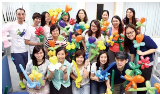
大家都興奮能夠扭出各色各樣的氣球。 Everyone was so excited to twist various balloons successfully.