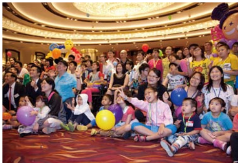
願望家庭均非常高興能夠參與一年一度的夏日聯歡會。 Wish Families were very glad to attend our annual Summer Party.

我們在此衷心感謝香港君悅酒店、凱悅酒店一尖沙咀和凱悅酒店一沙田的贊助各支持，他們的義工團隊的力量和愛心更是值得讚許。我們約定「明年再見」！