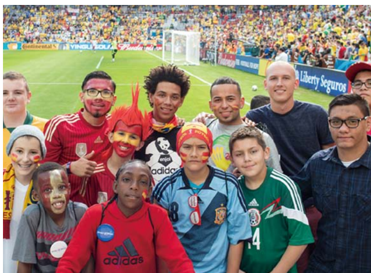
來自不同國家的願望童，齊集巴西觀賞世界盃。 Children from different countries gathered in Brazil to watch the World Cup.

It is a given that soccer has become the most influential and popular sport worldwide. The World Cup tournament is held every four years, and is anticipated by many. Lots of seriously sick children also look forward to and follow the event. During the 2014 FIFA World Cup in Brazil, all thirty-nine Make-A-Wish affiliates around the world fulfilled more than 50 little fans' dreams. They came from different countries, supported different teams, spoke different languages, but they shared one wish...to watch a match at the World Cup in person. Some of the children have waited many years for this opportunity. Their persistence and patience finally paid off thanks to the facilitation of Make-A-Wish® Brazil. More than 50 fans flew to Brazil with their families to cheer-on and enjoy watching their favorite teams play live.