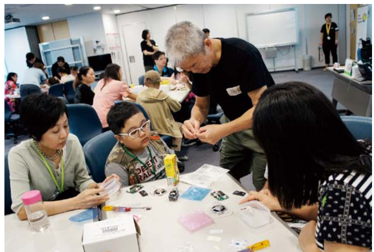
SONY 的義工正耐心地教導願望童。 SONY Volunteer is teaching Wish Child patiently.