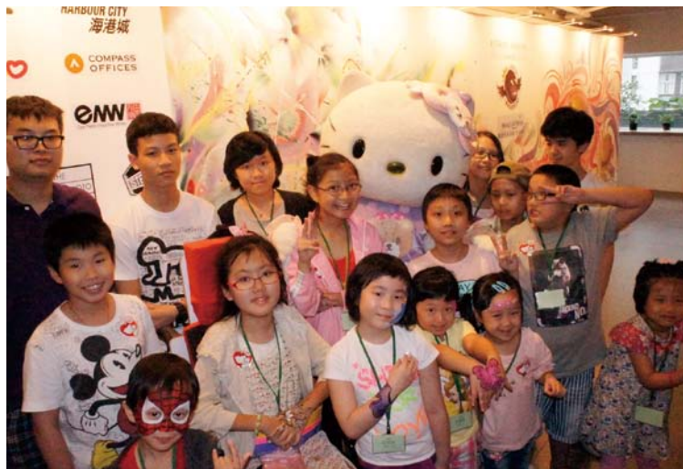
畫上彩繪的願望童與Hello Kitty愉快地合照 Wish Children with body painting take a picture with Hello Kitty.