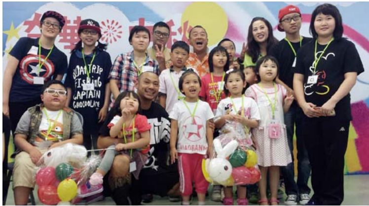
願望童與曾志偉、江欣燕及金剛合照。 Wish Children have a group photo with Eric Tsang, Elvina Kong and King Kong.