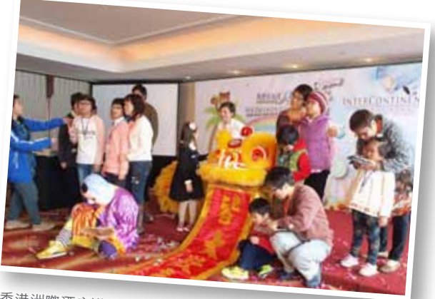
香港洲際酒店邀請了舞獅隊到場助慶。 InterContinental Hong Kong invites lion dance for the party.