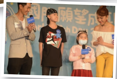
慶祝活動大使陳柏宇先生（左）及鍾舒漫小姐（右）在台上與願望童分享願望故事 Event ambassadors Mr Jason Chan (left) and Ms Sherman Chung (right) share their wish stories with our Wish Children on stage.