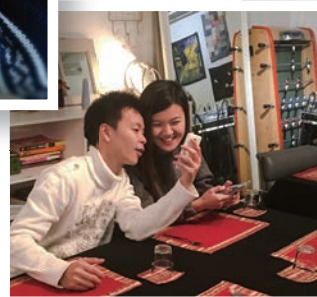
義工朋友的得意之作，好看嗎？ Don't these look nice?