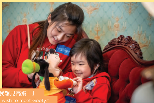
「我想見高飛！」 "I wish to meet Goofy." 鈞淇 Kiki/ 4/ 急性白血病 Acute Leukemia