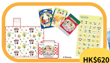
加倍「有力量」套裝 Double Your "STRENGTH" Combo Set